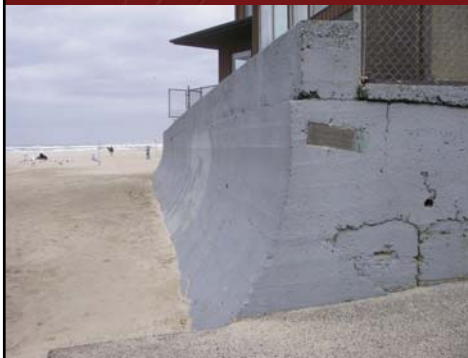
Curved Reinforced Concrete Seawall