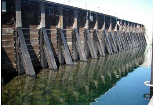
Marina Breakwater Wall