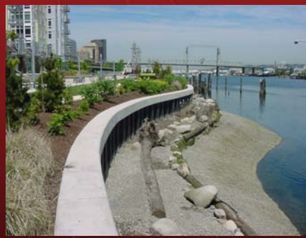
Sheet Pile Seawall